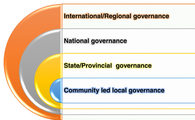
Fig. 2. Response management framework.

Under these circumstances, the mechanism for response management needs an approach of governance maximization instead of focusing only at resource maximization. For instance, South Asian countries people in the age group 65 years and older account for a small proportion of people in the overall population pyramid. This is a comparative advantage for the region when trying to keep the mortality rate low, as older people are the most vulnerable to COVID-19. Hence, policy actions and their proper implementation to protect the aged (and also persons with comorbidity) in the course of the pandemic will be more beneficial instead of leaving them socially unprotected and thereafter striving for more ventilators to cater for their medical needs. This framework of response management needs governance coordination (between local, state and national governments), collaboration (on a national and international level), and cooperation (within international/regional organizations and among countries).